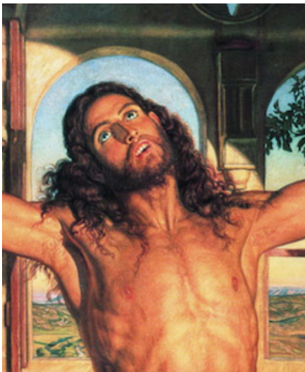
Holman Hunt, Detail of The Shadow of Death , 1873

"Another voyage brought him eventually to Palestine. There he made a spiritual pilgrimage. There, through all the sacred places of that - to him - Holy Land, he followed, always with his bag of tools on his back, literally in his Master's footsteps and following his Master's trade."