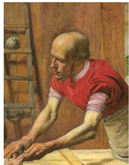
Detail of John Everett Millais' The Carpenter's Shop , 1849-50